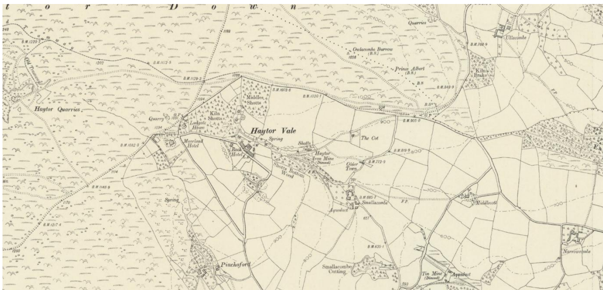
Figure 8. O S Map Haytor Vale 1906

The 1906 O.S. map shows only The Shotts and The Cot on opposite sides of the old miners' track, presumably some houses were not far enough advanced to be included when the original mapping was undertaken two years previously (Fig. 8).