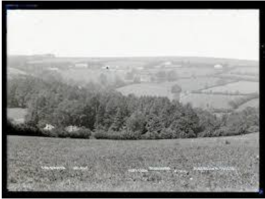
Figure 11. The Shotts Bel Alp Alpiglen Blueburn Oldertown Shotts c. 1939