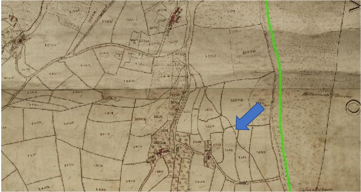
Figure 1. 1838 Tithing Map Haytor Vale showing the Miners' Track in blue and the Bovey Tracey/Haytor Road in green.