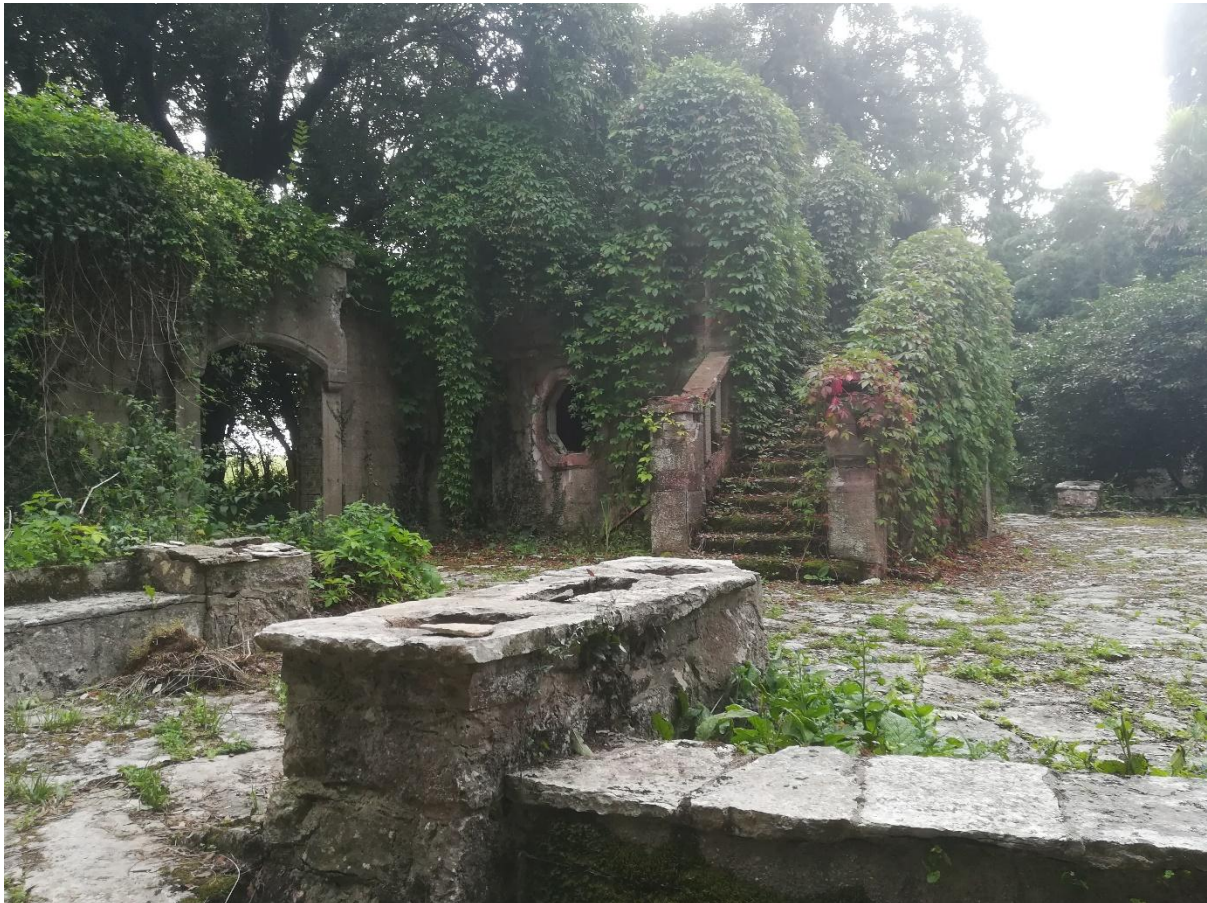
Figure 7. Garden at Great Ambrook.