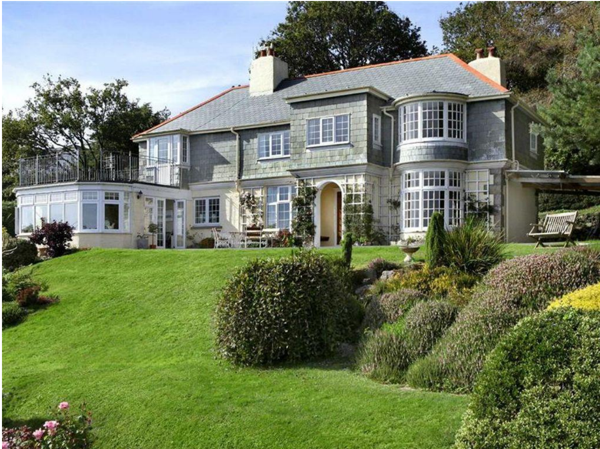
Figure 10. The Cott - later Alpiglen and now Fox Hill House . Frances Billinge 2025.