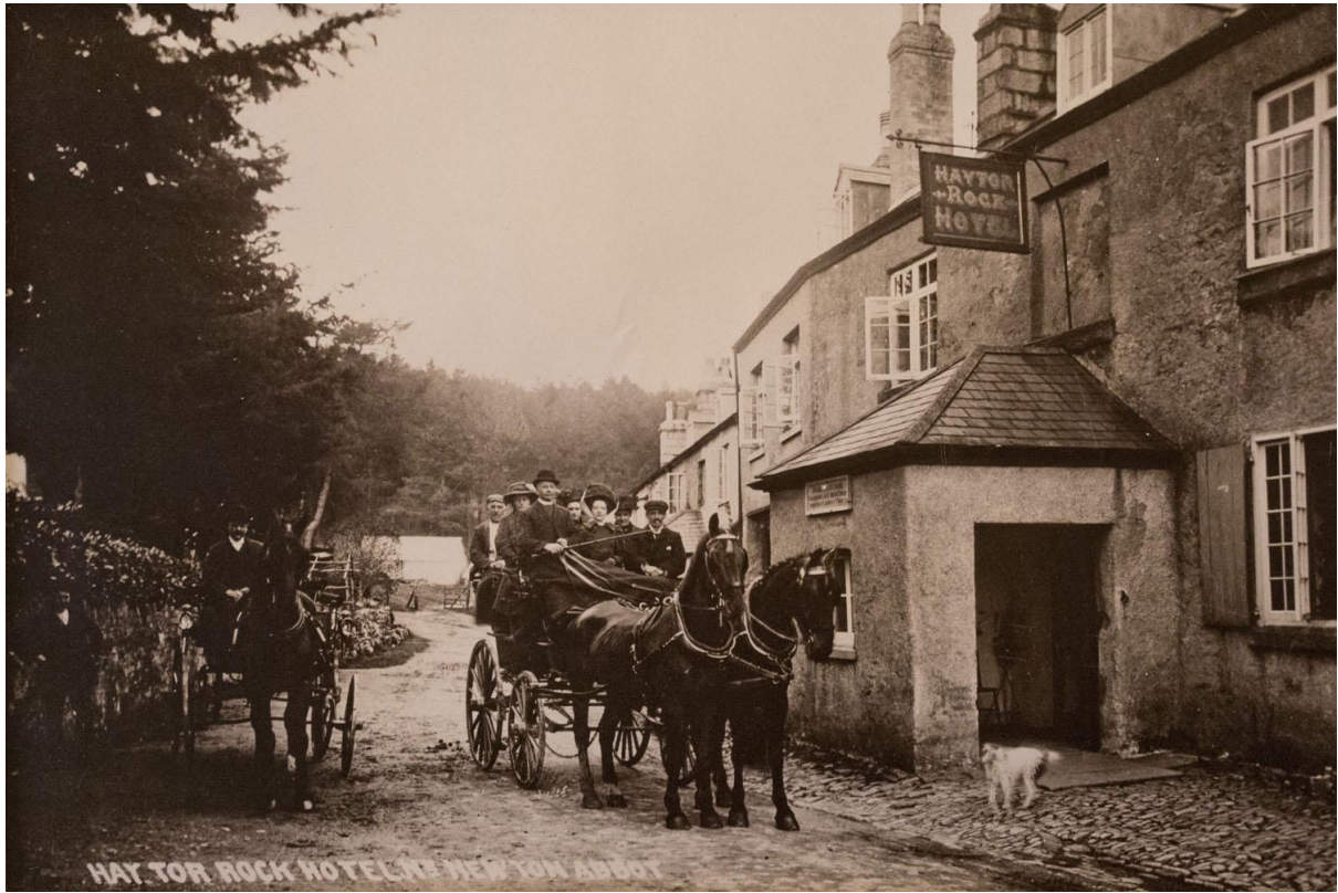
HAYTOR ROCK HOTEL IN NEWTON ABBOT