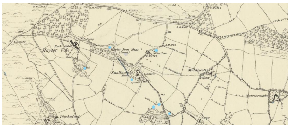
Figure 4. OS Map 1885 Mining Shafts in Haytor Vale

There was a long history of mining and in 1858 Joseph Wills of Smallacombe granted rights to speculators to search for minerals in parts of the Smallacombe estate. Several small mines were in operation during the 1860s and 1870s including Rock Hill, Oldertown, Shotts and Hetherley. 6 Figure 4 shows several mining shafts highlighted in blue.